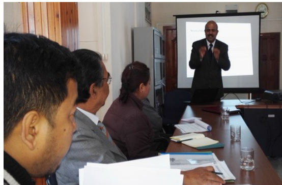
Religare Insurance Company Vice-Chairman briefing insurance policy