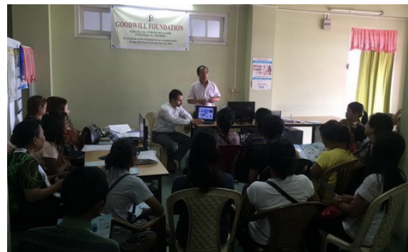
Financial Literacy Campaign in the office