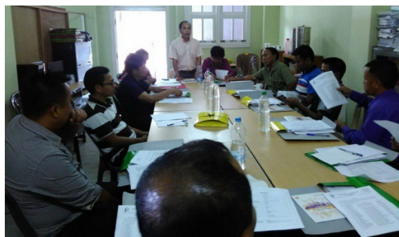
Training given to Local Council Leaders in Goodwill Foundation's Conference hall

The following are some of the valuable works done by Goodwill Foundation during the financial year 2016-2017.