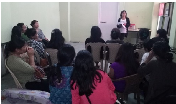
SHGs Area Level Federation meeting

Goodwill Foundation has been working as Resource Organisation (RO) of the National Urban Livelihood Mission (NULM) project under Urban Development and Poverty Alleviation (UD & PA) Department, Government of Mizoram in Aizawl urban area. More than 100 SHGs have been formed, developed and nurtured by the organization. The SHGs have been credit linked with NABARD Financial Service Limited. Most of the SHG members avail loan and started their own enterprises earning good income for their families. These SHGs have been given continuous hand holding support such as leadership training, management, book keeping and accountancy etc.