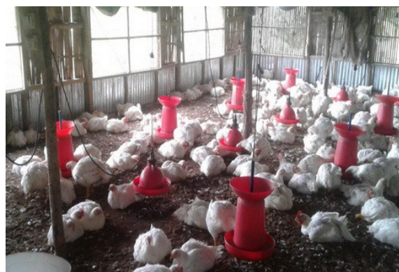
Poultry farm of the FPO member in Melriat village