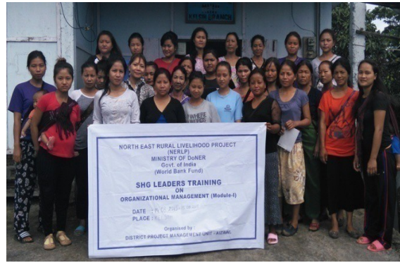
SHG Training in Kelsih village