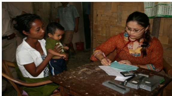
Doctors checking health of children

Woman and child welfare is one of the main focus of the organisation. Different programmes were organised for the welfare of women and children in different places. Free medical health checkups and awareness programme on Maternity Health and other related health issues were conducted in the rural areas from time to time to check the health status of women and children. Maternity Health Care awareness programme was held in Tachhip village on 19 th April, 2016. The health of 115 women have been check up and free medicines were distributed to them.