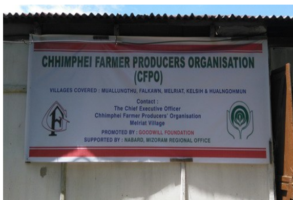
Chhimphei FPO Office Signboard

Goodwill Foundation has promoted two Farmer Producers Organizations (FPOs) in Aibawk block in Aizawl district with financial support from NABARD covering 9 (nine) villages viz: Hualngohmun, Melriat, Kelsih, Falkawn, Muallungthu, Tachhip, Aibawk, Sateek and Phulpui. The two FPOs are named Chhimphei FPO and Bungpui FPO. Bungpui FPO has 251 members while Chhimphei FPO has 253 members. Bungpui FPO office is located in Sateek village and Chhimphei FPO in Melriat village. The farmers are given different training on agriculture and livestock management. Their productions were collected and marketed in Aizawl and other towns in Mizoram by the FPO. It is the first time of its kind in Mizoram that farmer producers organization has been formed by the initiative of NABARD Mizoram Regional office and Goodwill Foundation.