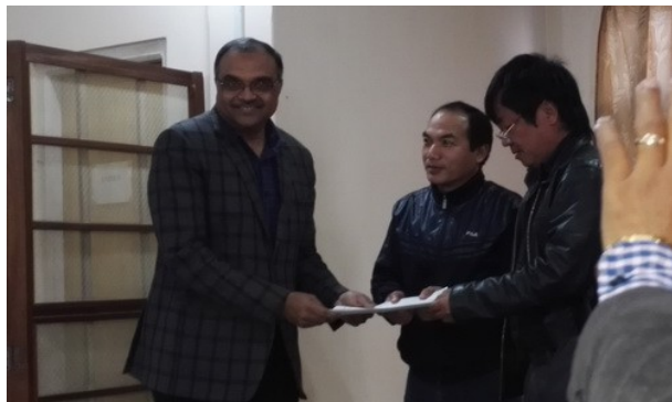
Signing of Agreement with Religare Insurance

Goodwill Foundation in association with Religare Health Insurance Company limited, New Delhi taken up health insurance policy for Self Help Group members in Aizawl district of Mizoram on Mediclaim Policy/ Personal Accidental policy since January, 2016. Under this programme as many as 350 members have been enrolled under the policy. The objectives of the insurance is for medical re-imburement in times of hospitalization and accidental purpose.