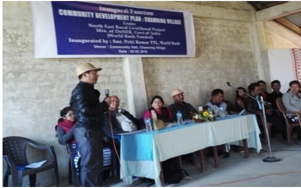
Inauguration of Community Development Plan in Chamring village in the presence of World Bank team