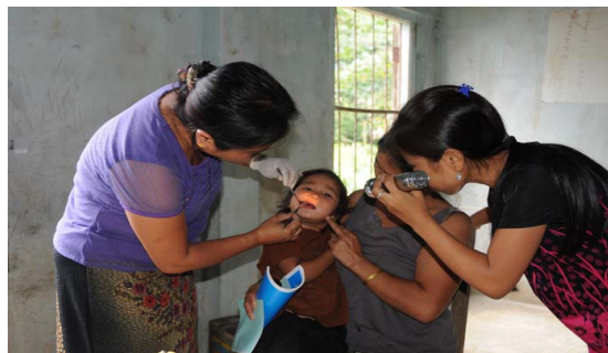
Free Medical Health check up