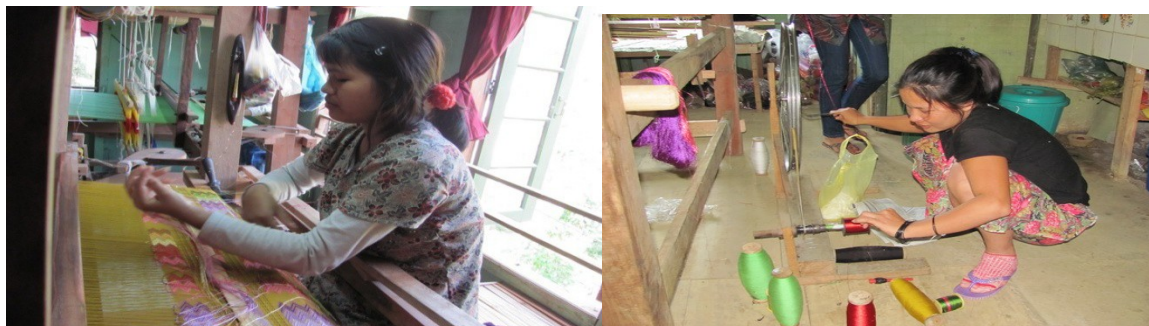
Handloom training in full swing

Handloom and handicraft training is among the priority of the organisation. More than 300 youth have been given training in handloom and handicraft by the organisation. Many of them have set up their production units in different places in Mizoram earning good income out of it. Mizo handloom has an increasing demand not only in Mizoram but also in nearby states such as Manipur, Nagaland, Meghalaya, Tripura and Assam as well. Therefore, Goodwill Foundation has given priority in handloom training for young women.