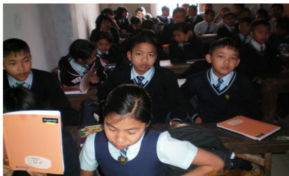
Students in the classroom

Goodwill Foundation School is one of the main activities of the organization located at Peter's Street, Mission Veng, Aizawl. The school provides free education to children who are not able to continue schooling because of financial difficulty and poverty. During the academic year 2016-17 the institute has admitted 475 students out of which many students have been admitted free of cost. The school is recognized by the Government of Mizoram as private co-educational institution from Nursery to standard X. The school produced a very good result in the last High School Leaving Certificate (HSLC) Examination, 2016 conducted by the Mizoram Board of School Education (MBSE).