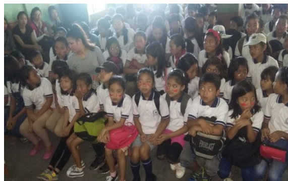
Students in their sports dress